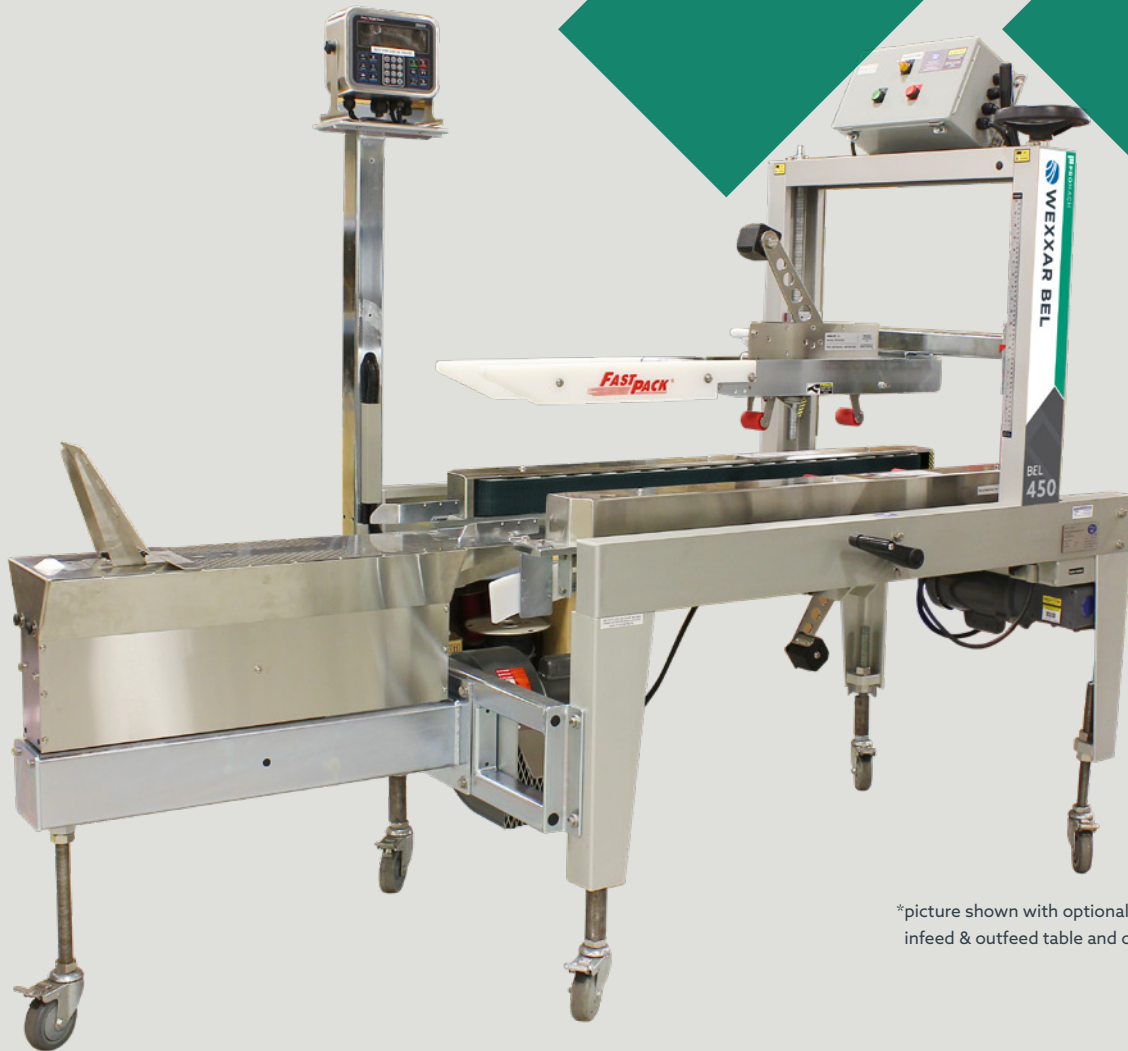
*picture shown with optional infeed & outfeed table and casters