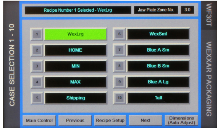
Up to 30 case recipes can be easily stored and retrieved from the machine's touch screen control panel.

All actuator devices are self-contained with quick-disconnect, meaning replacement is quick and easy. The positioning actuators are fully integrated with our machines meaning maintenance and troubleshooting can all be done from the HMI.