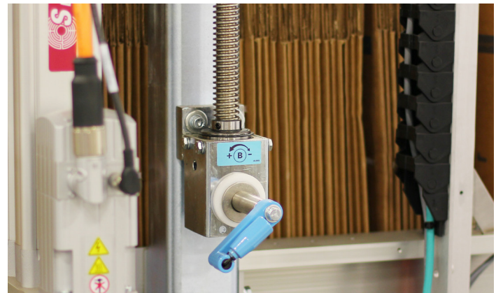
Color-coded size change handles allows flexibility to do manual size change when needed.