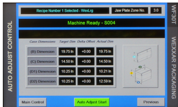
One touch case size changeover.

The Auto Adjust Package is available on our premium models of Wexxar Bel case erectors and sealers including the WF30, BEL 290 and the DELTA 1.